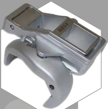
Femoral and Box Trial