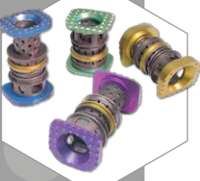
Adjustable Corpectomy Cages